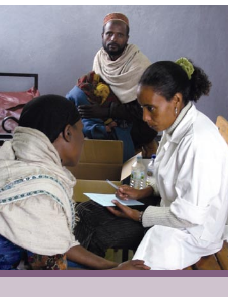
Above: This woman is being counseled by a provider-trainee prior to receiving an implant at one of Pathfinder’s many service delivery-based trainings for long-acting family planning methods.