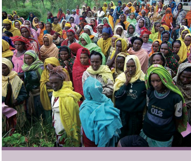
Above: In a clear demonstration of the dimension of unmet need, hundreds, and sometimes thousands, of women show up when they learn that long-acting family planning is available.

Pre- and post-tests are administered at the beginning and end of the training, and competency-based clinical evaluations and feedback sessions are held at the end of each training day. Regional Health Bureau Certification is issued to all graduates of the training. The trainings attract hundreds, or even thousands, of clients during several sessions. Between October 2004 and February 2007, 1,158 service providers from 650 facilities were trained in providing LAFP services in the four target regions. During these trainings, 47,637 clients were provided with implants and IUCDs. 8