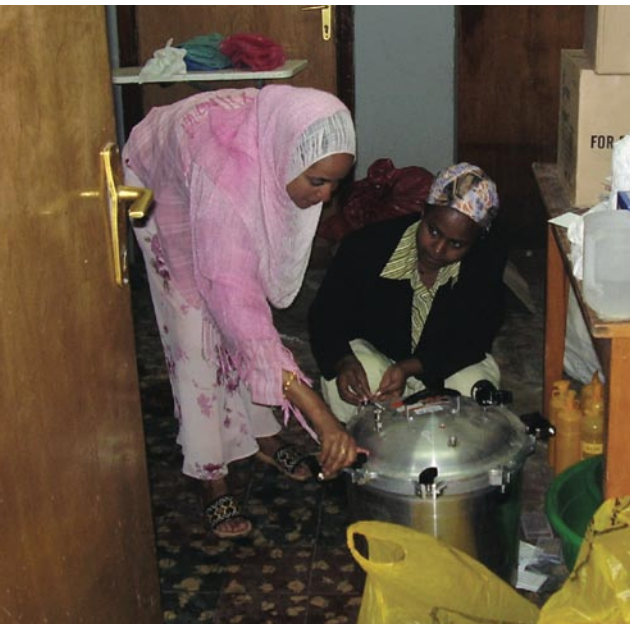
Above, left: All trainees as well as support staff are trained to properly sterilize and handle equipment to be used in both implant and IUCD insertion.