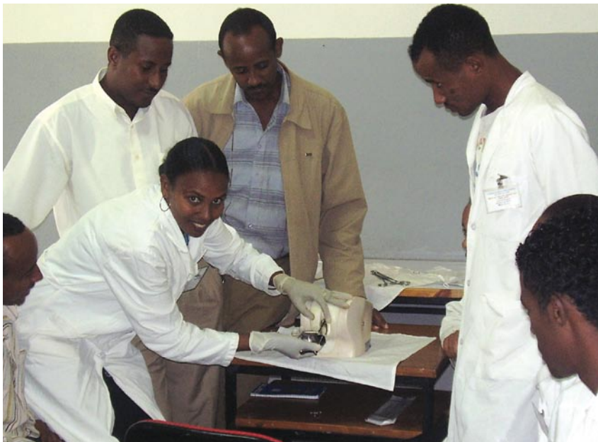
Above, right: Trainees practice on anatomical models during the technical phase of training.