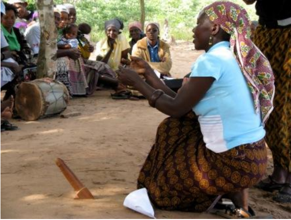
The Essential Knowledge section of the Condom Use

Toolkit contains up-to-date, evidence-based information on female and male condoms—the only contraceptive methods that protect against both pregnancy and sexually transmitted infections (STIs), including HIV. Policy makers, program managers, service providers, and other health care professionals can use this information to increase access to condoms.